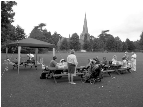
Summer Family Picnic, August 2008

Summer 2008 was an extremely busy time for our Senior Co-ordinators as they worked closely with Stroud and Dursley Home-Start to submit a joint bid for funding from Gloucestershire Children and Young People's Partnership. We applied for funding to set up the 'Enjoy and Achieve Project' that we knew would be of significant benefit to some of our families. After a great deal of hard work, we were delighted that our bid was successful and have since been able to train volunteers to deliver this extra support. The project is delivered by volunteers taking books and educational toys into the home on their weekly visits, working through a Home-Start Activity Booklet together and helping parents to access some of the many different learning opportunities in the community. This is proving an excellent tool, especially for those parents who had struggled themselves at school and don't know where to start in helping their own children.