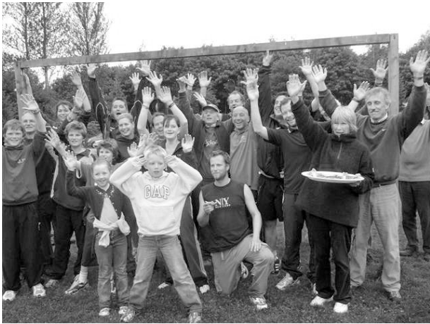
Home-Start Cotswolds team for the Football Frolic II event, May 2008

A Waitrose collection day, coffee mornings and even a riotous 50-a-side football match, were among the events organised by staff and trustees throughout the year, which helped raise awareness of Home-Start Cotswolds and additional funding.